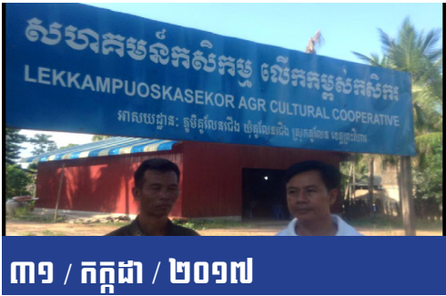
៣១ / កក្កដា / ២០១៧