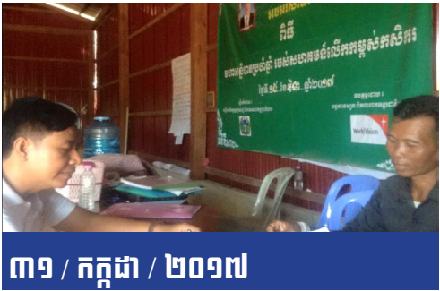
៣១ / កក្កដា / ២០១៧