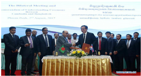
Bangladeshi Food Minister Qamrul Islam (front L) shakes hands with Cambodian Minister of Commerce Pan Sorasak (front R) during a signing ceremony in Phnom Penh, Cambodia, on Aug. 2, 2017. Bangladesh signed a Memorandum of Understanding (MoU) on Wednesday to purchase 1 million tons of milled rice from Cambodia within five years from 2017 to 2022.