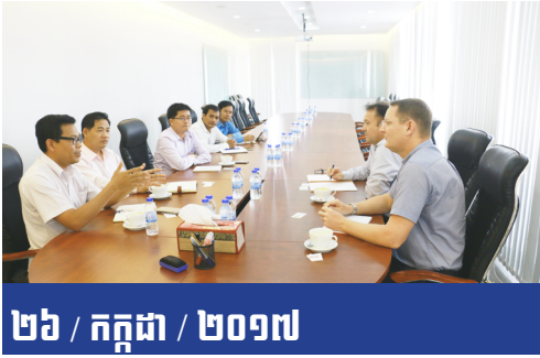
២៦ / កក្កដា / ២០១៧